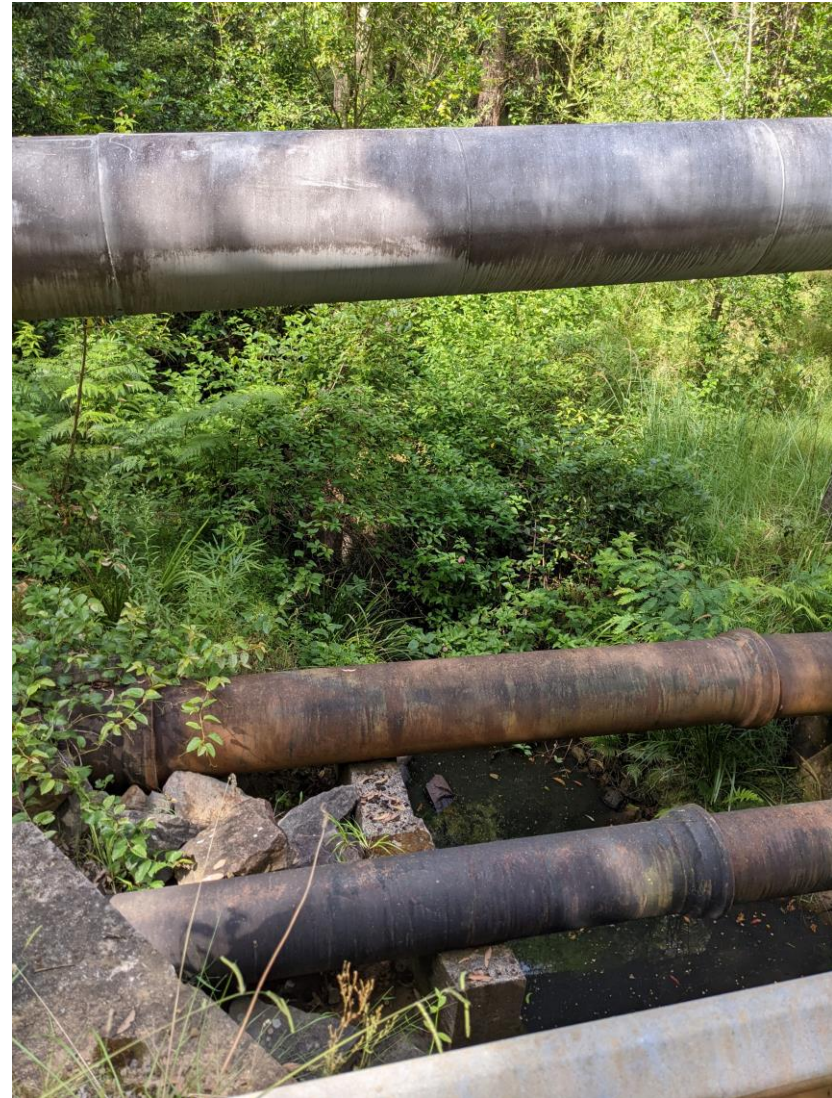
Plate 6 Four Mile Creek at Discharge Location