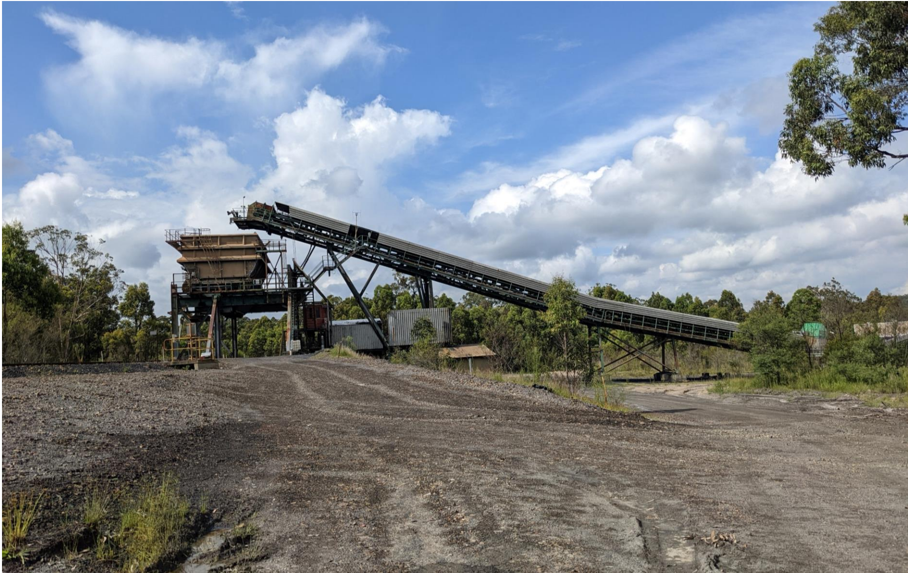
Plate 9 Bloomfield rail load out facility, rail loop and rail spur