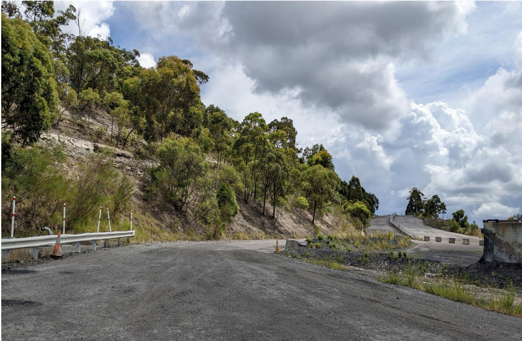
Plate 12 Haul road from Abel Coal Mine entrance, with incident rehabilitation of vegetation on escarpment