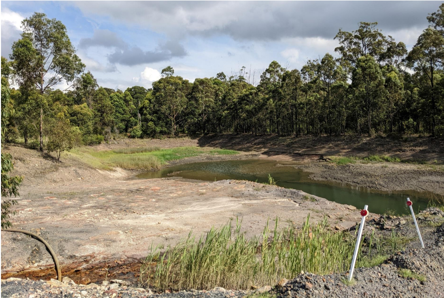
Plate 11 Sediment pond at Bloomfield CHPP, in the process of being dredged to improve capacity