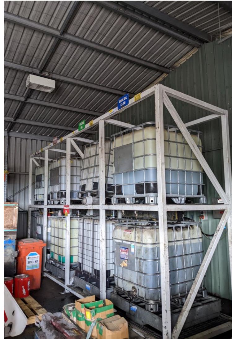
Plate 2 Fuel and oil containment