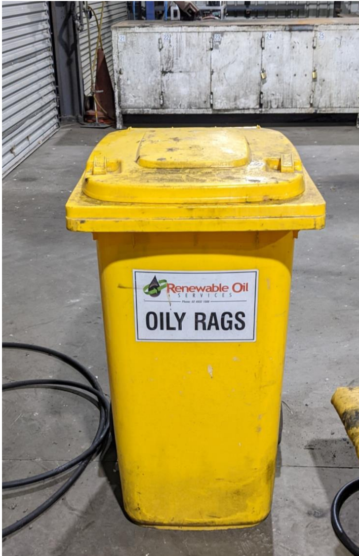
Plate 1 Storage of hydrocarbon waste in workshop area