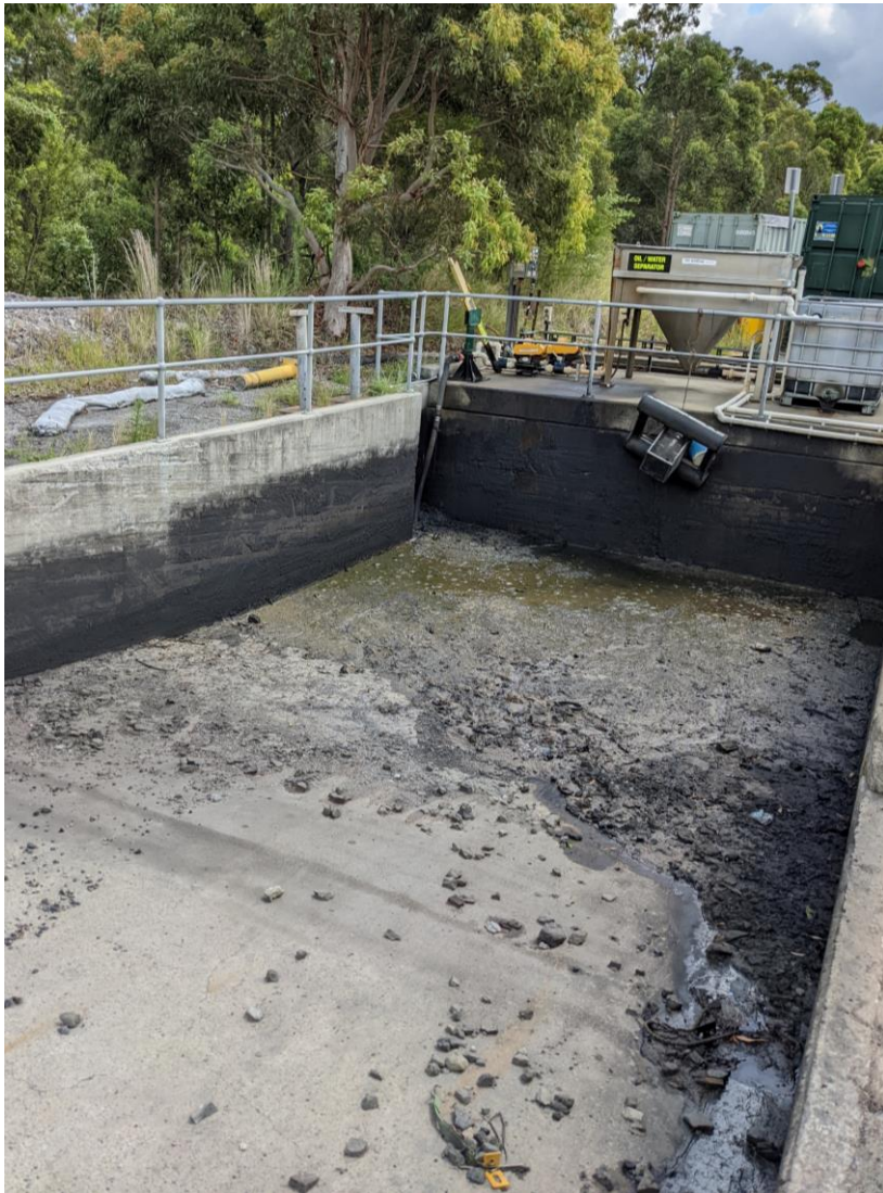
Plate 3 Sump pit