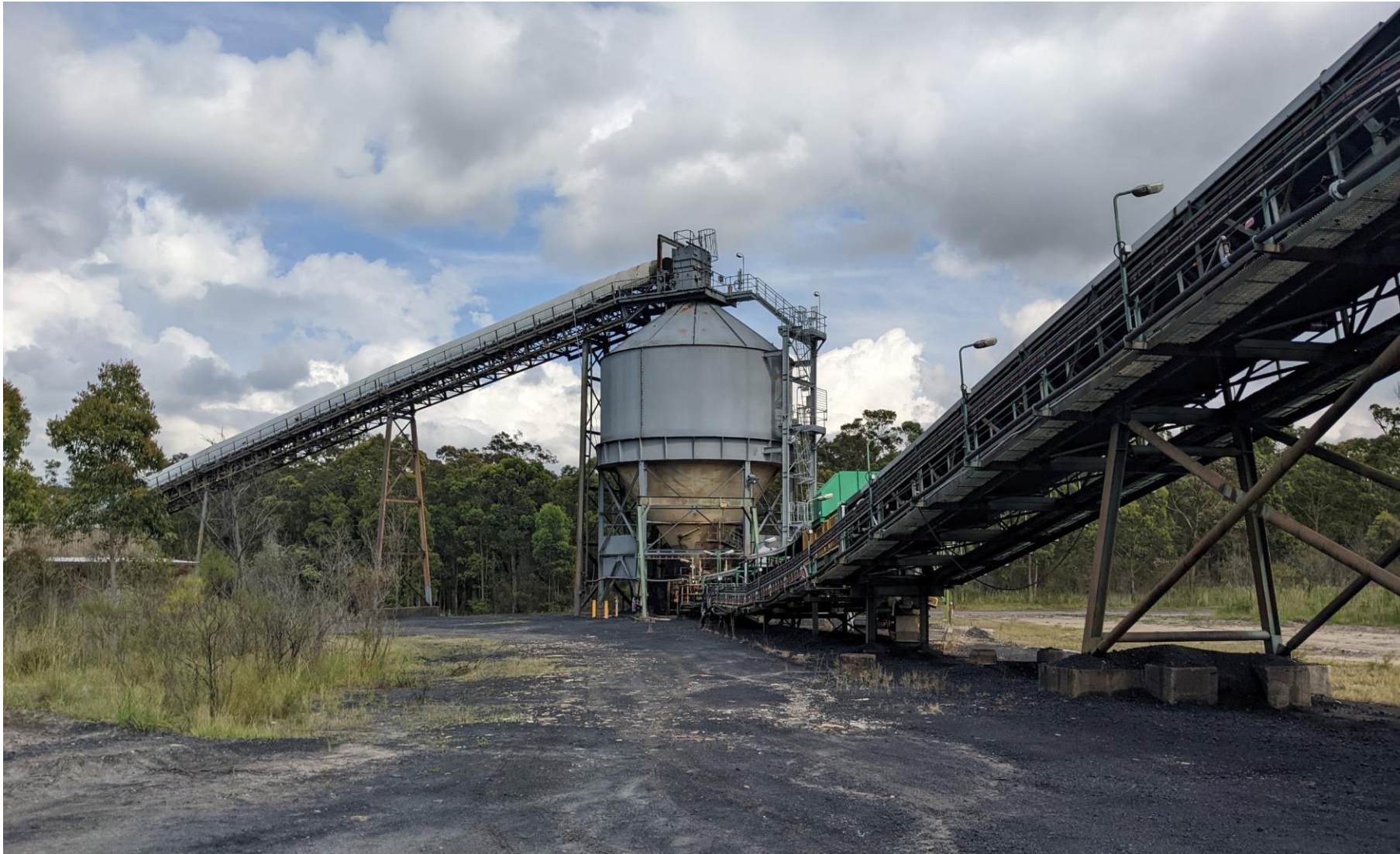
Plate 10 Conveyors at Bloomfield CHPP to the rail load out, rail loop and rail spur