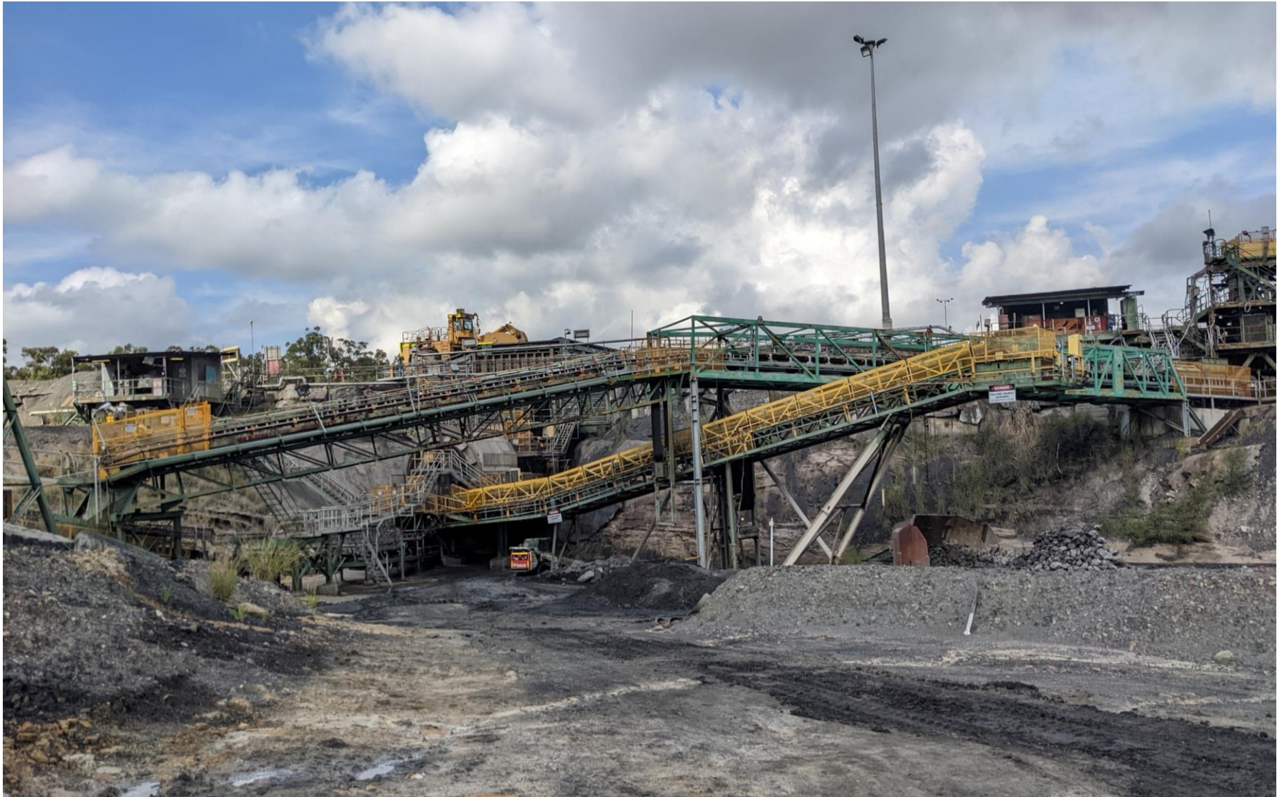
Plate 7 Bloomfield CHPP/Washery