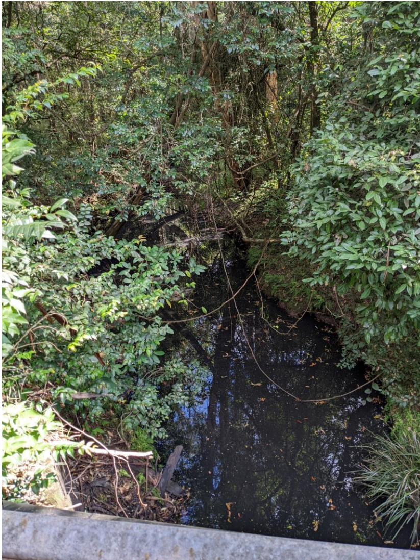
Plate 5 Four Mile Creek at Discharge Location