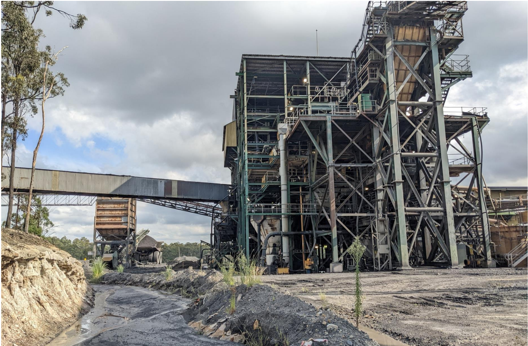
Plate 8 Bloomfield CHPP/Washery