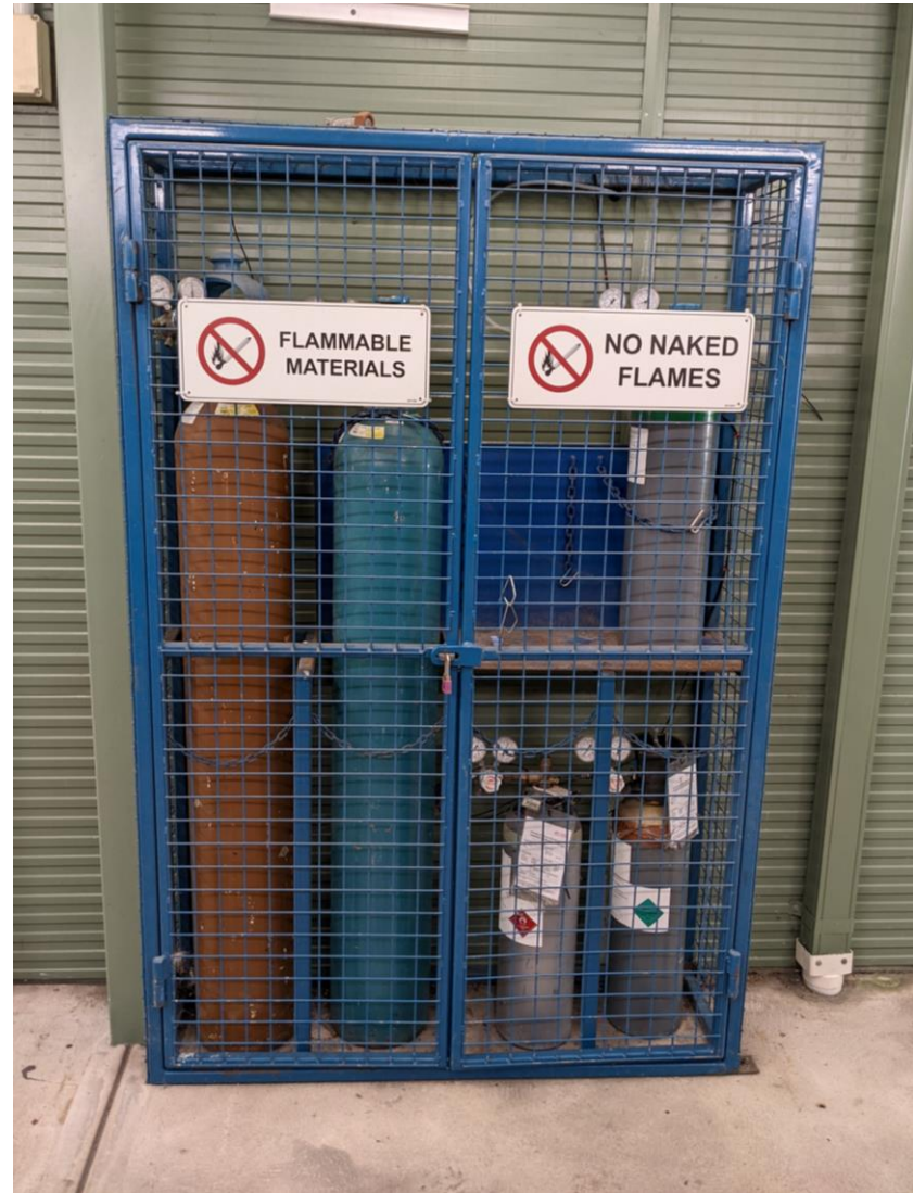
Plate 4 Labelling of hazardous materials