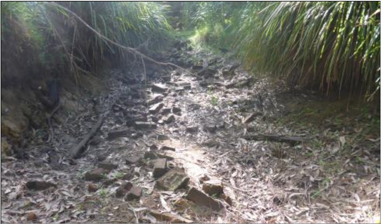
Plate 6.2 View northeast overlooking dam and location of former crossing