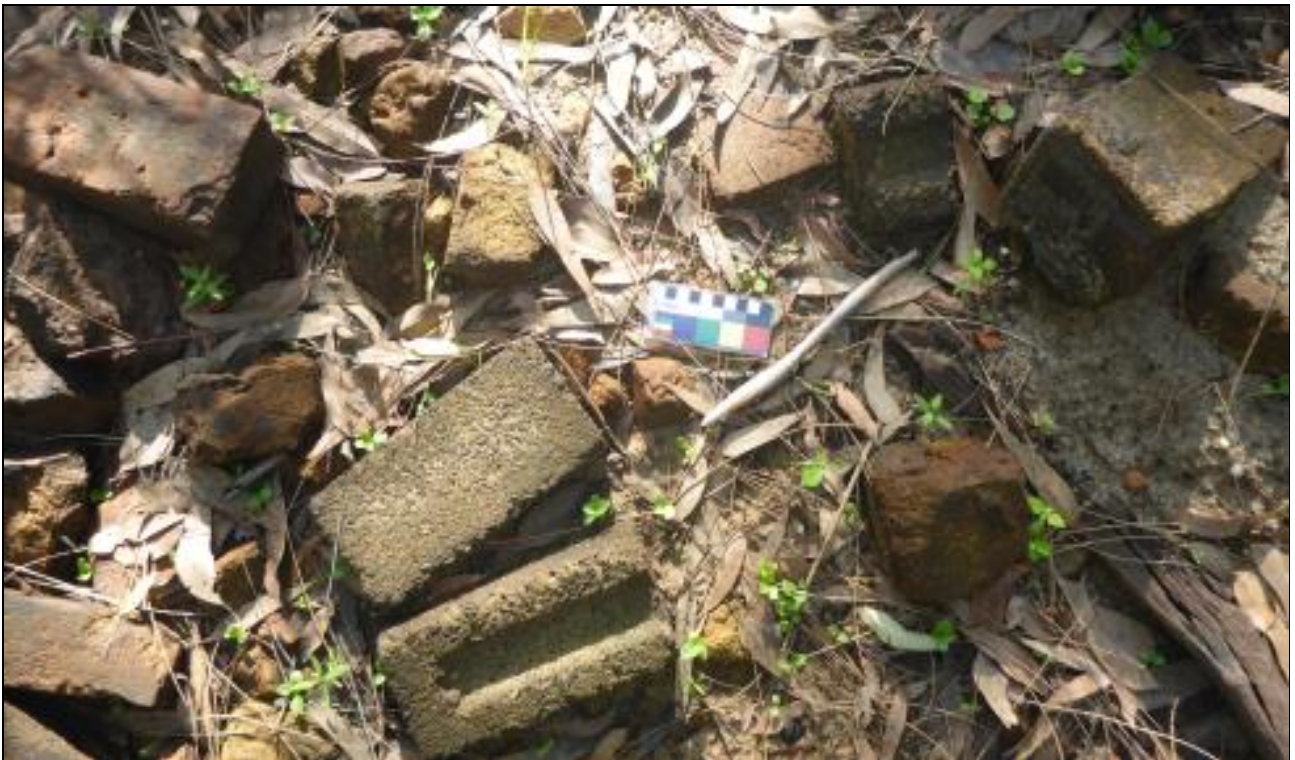
Plate 6.3 Close up of the bricks used for the crossing