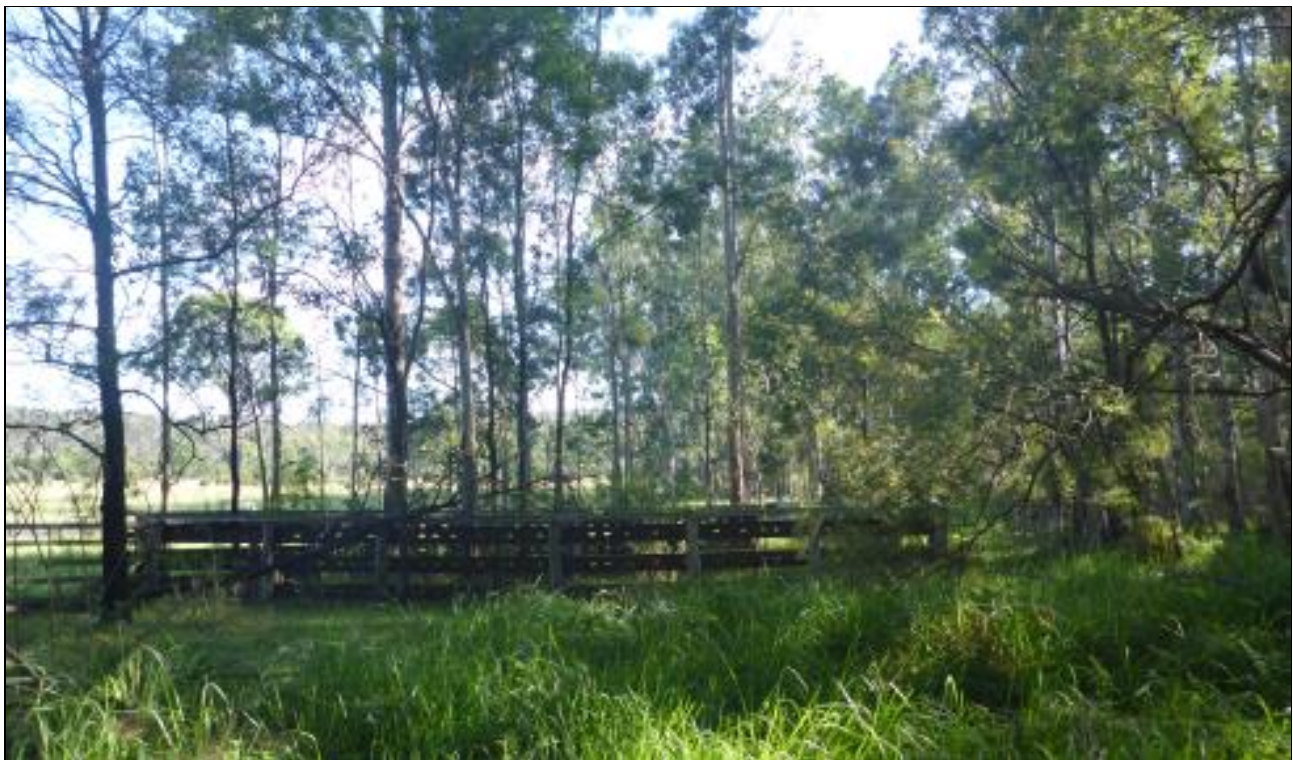
Plate 6.1 View of the former cattle yard within the LWB4-B7 Modification Area

A visual inspection of the LWB4-B7 Modification Area was undertaken on 7 and 8 February 2017 by Joshua Madden, Senior Archaeologist Umwelt. No structures relating to the Collieries of the South Maitland Coalfields/Greta Coal Measures locally listed item (I215) were identified during the site inspection, however a number of remnant rural infrastructure items were identified including a former timber cattle yard and a former brick creek crossing (refer to Plate 6.1 – Plate 6.3 ). The heritage significance of these structures is assessed in Section 6.7.4 .