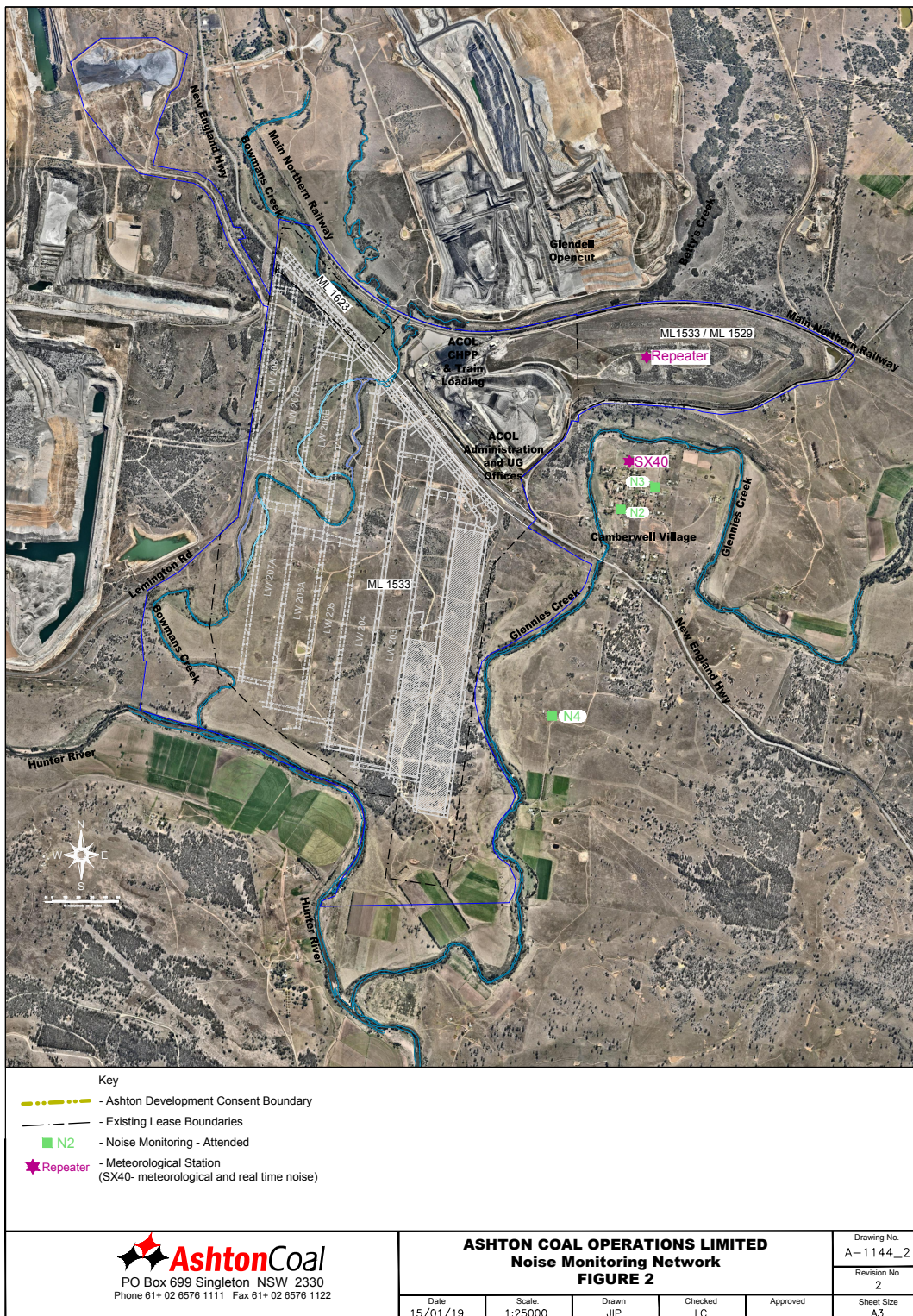
Figure 1: ACP Attended Noise Monitoring Locations