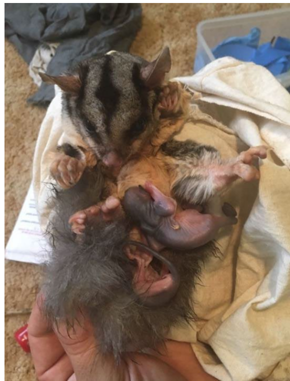
Plate 7 - Squirrel glider (Sharon) with young