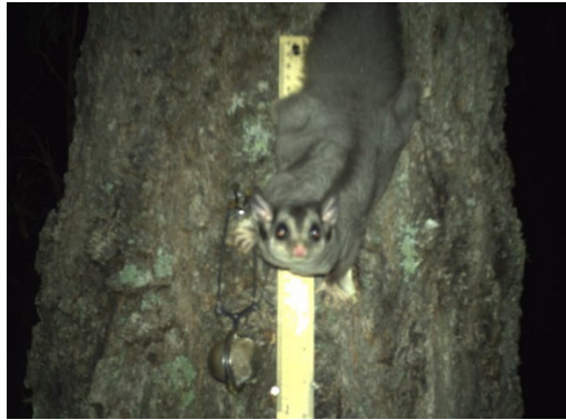
Plate 5 – Squirrel Glider photographed during initial camera trap surveys.