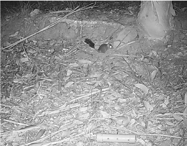
Plate 8 - Brush-tailed Phascogale ( Phascogale tapoatafa )

The fauna surveys confirm that the Stratford Offset, Biodiversity Enhancement and Rehabilitation areas provide foraging and breeding habitat for a range of native vertebrate fauna, including birds, mammals, reptiles, and frogs.