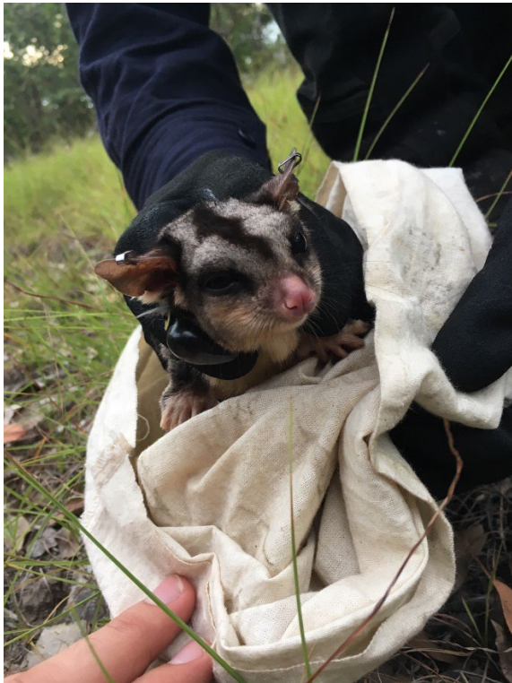
Plate 6 - Radio-transmitting collar fitted to squirrel glider