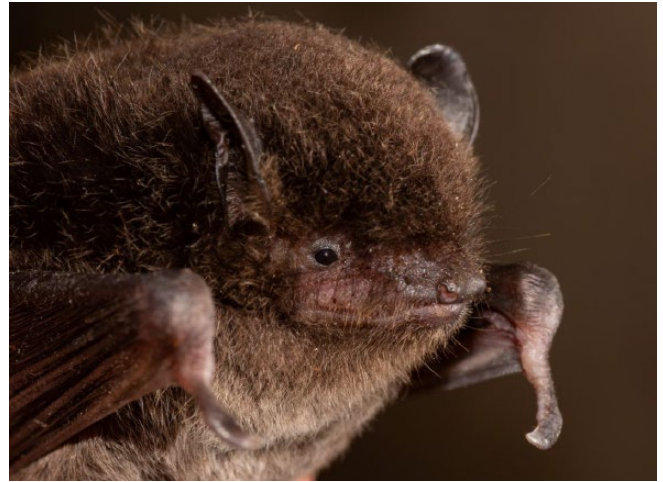
Plate 9 – Southern Myotis ( Myotis aelleni )