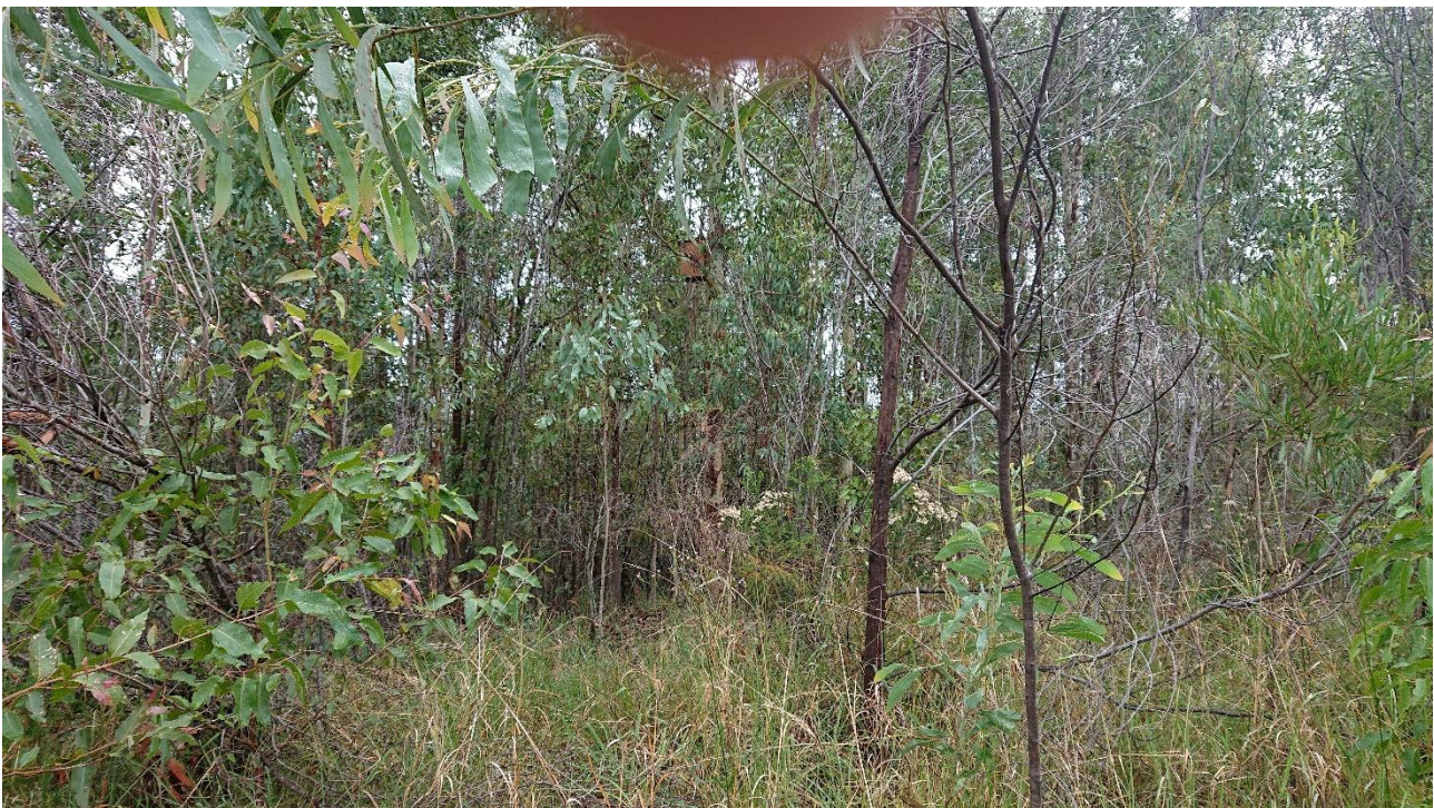
Photo 6 - Established Rehabilitated Waste Rock Dump