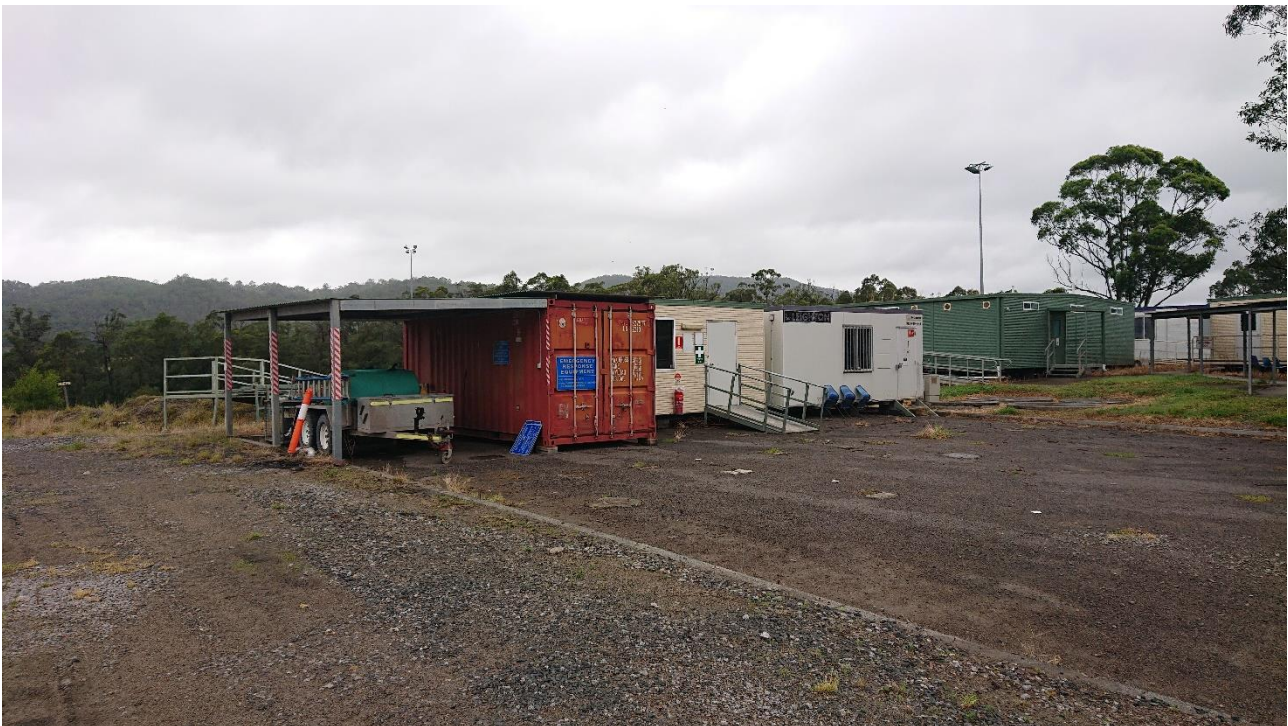
Photo 8 - Emergency Response Equipment