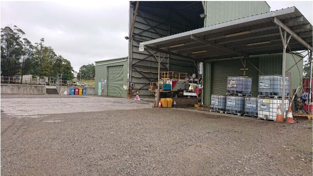
Photo 3 - Current Maintenance Area