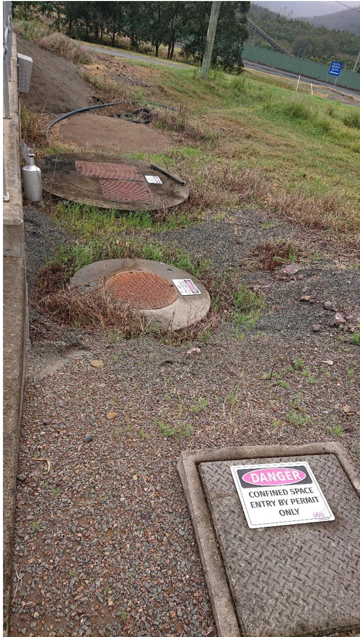
Photo 12 - Oil / water separator