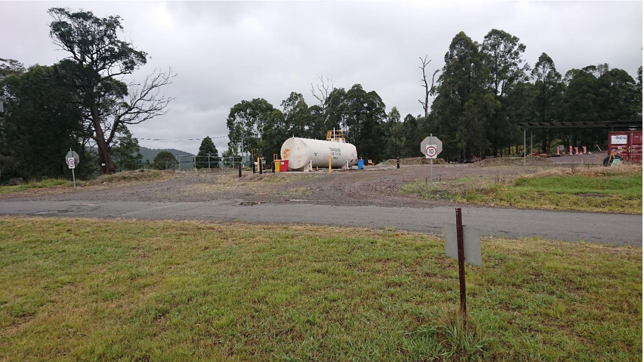
Photo 10 - Bulk Fuel Storage