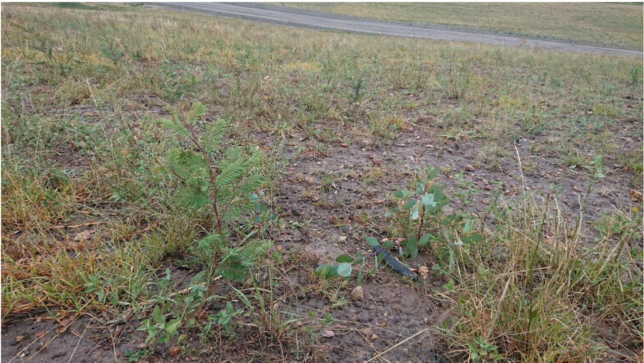
Photo 5 - Recently Rehabilitated Waste Rock Dump