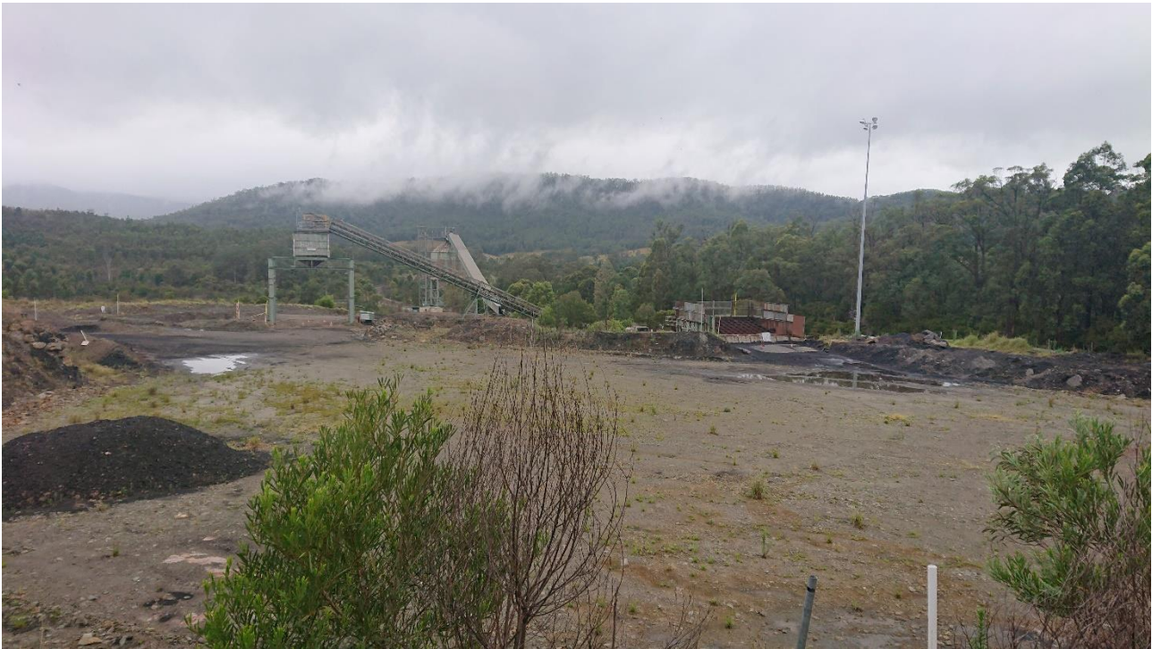
Photo 2 - Former ROM pad with rail loader in background