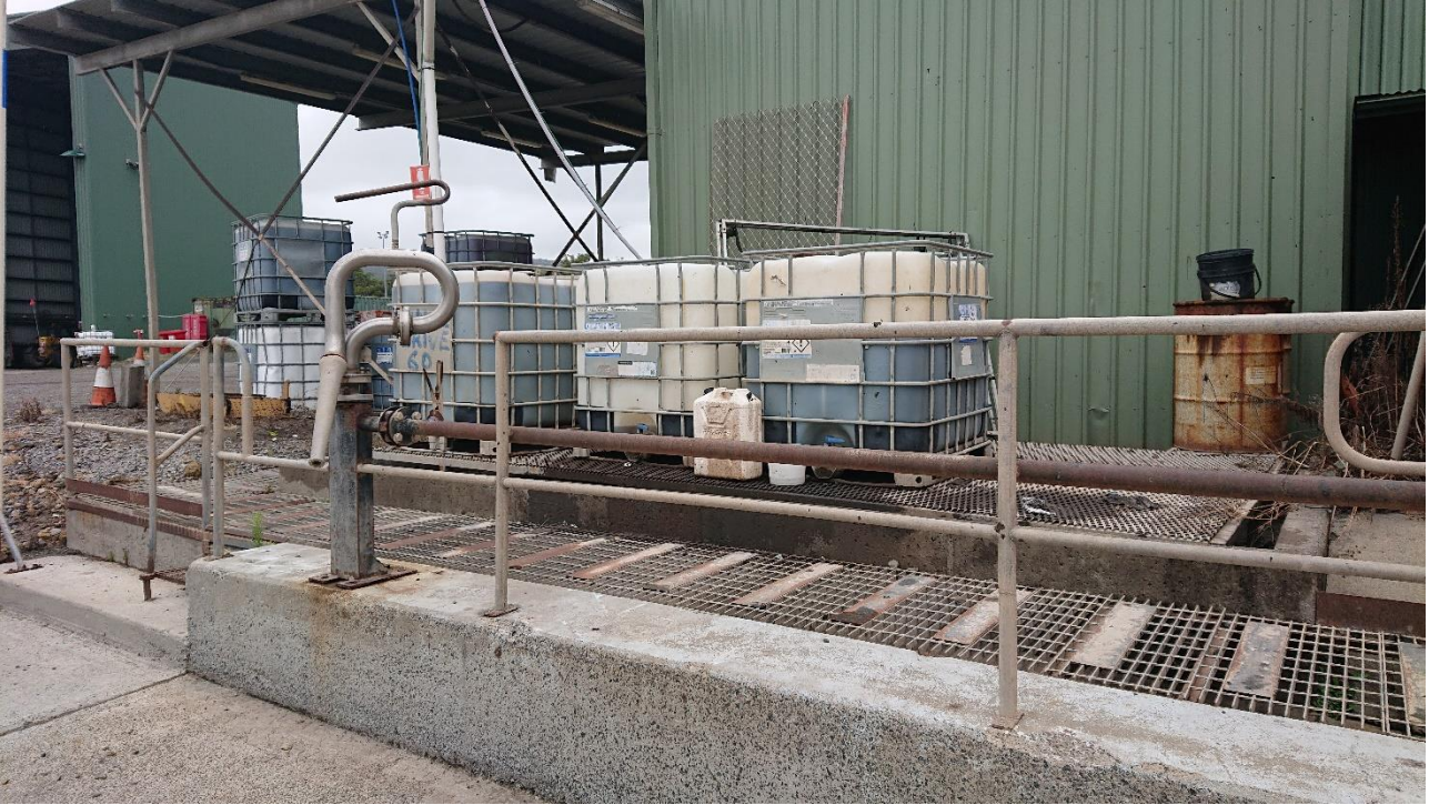
Photo 9 - Waste Oil Storage