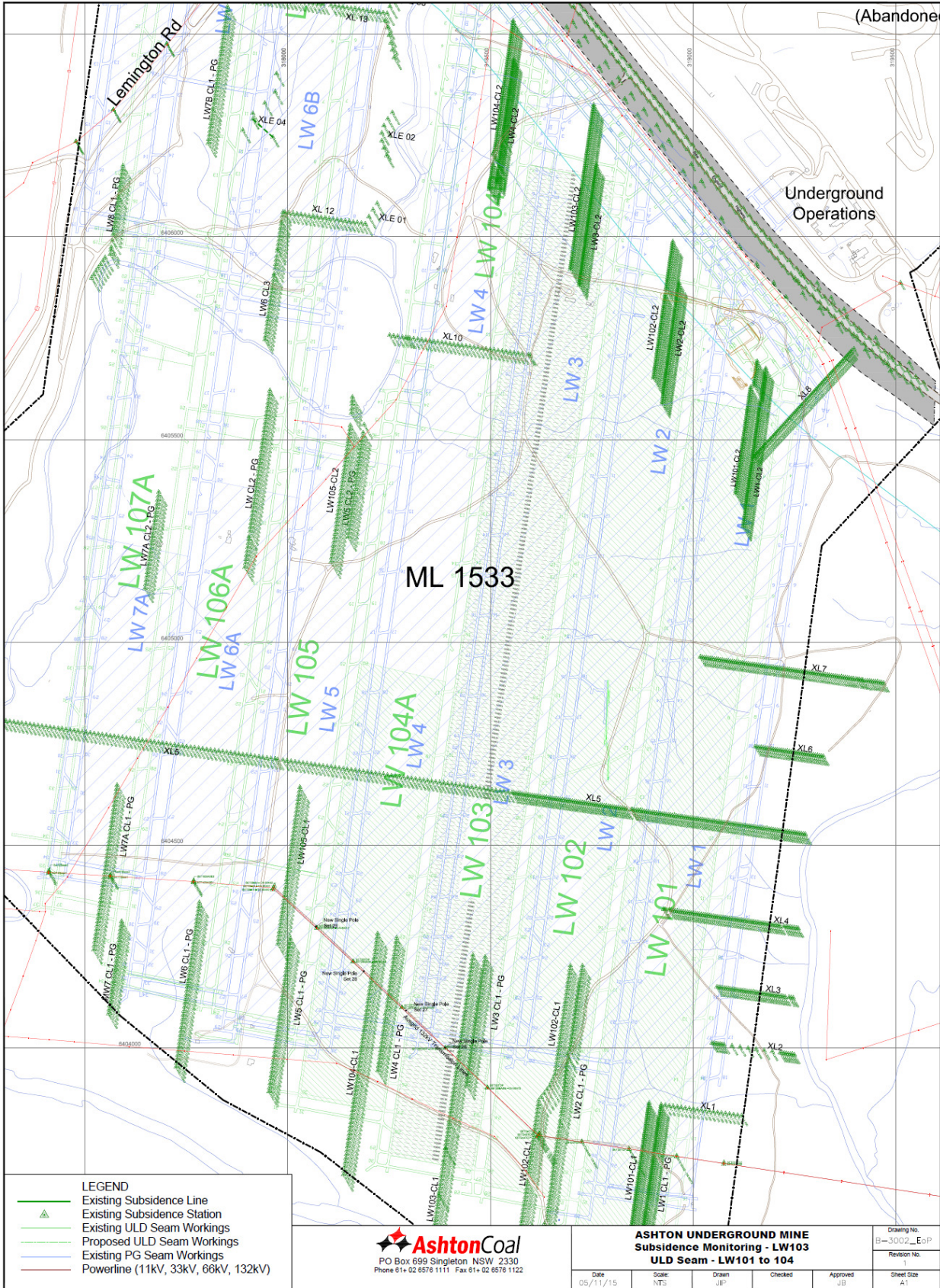
Figure 2 Plan Location of Subsidence Monitoring Lines