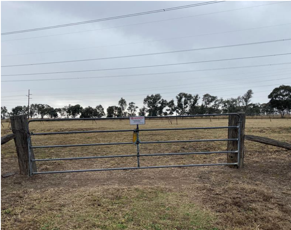
Photograph 8 - Effluent Irrigation Area