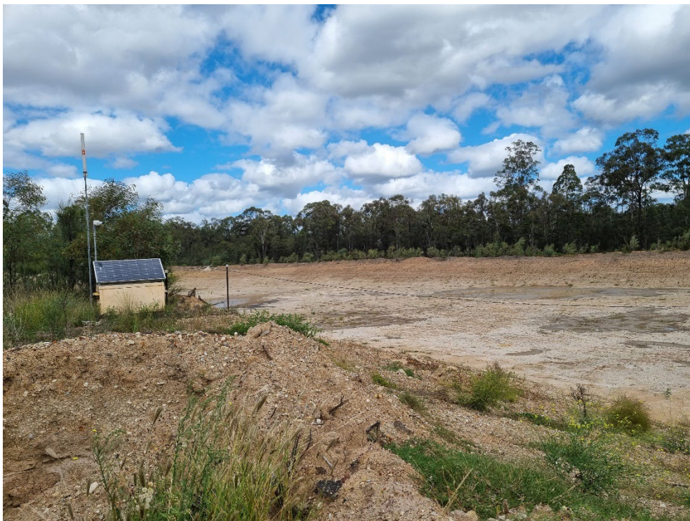
Photograph 4 - Sediment Basin