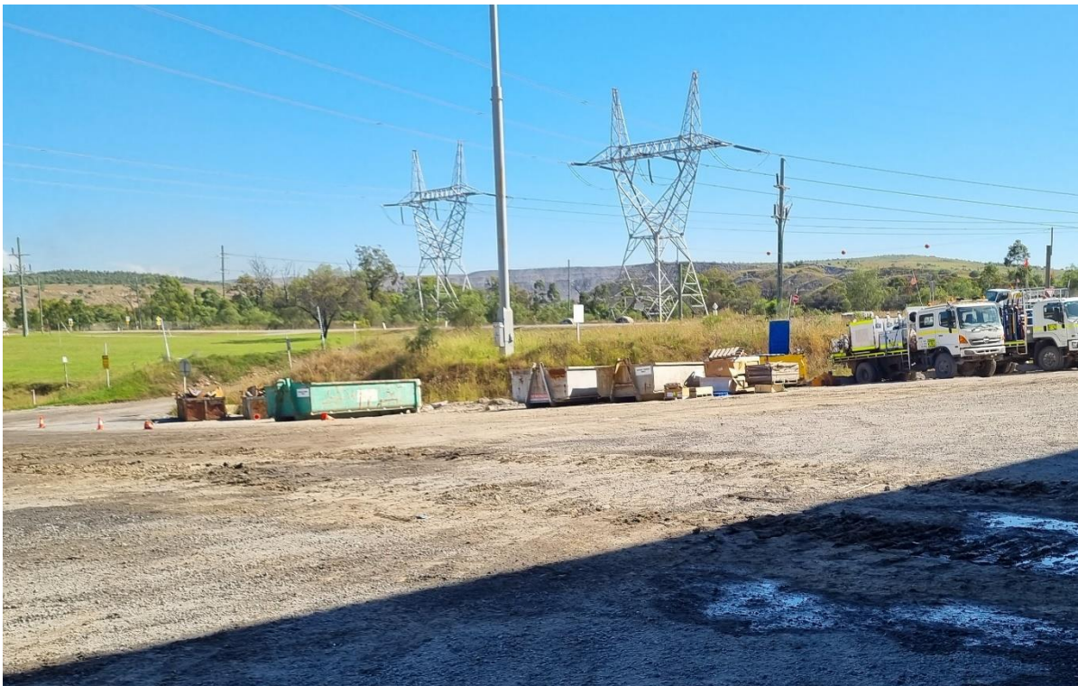
Photograph 10 - Waste sorting and storage at Mt Thorley Maintenance Facility