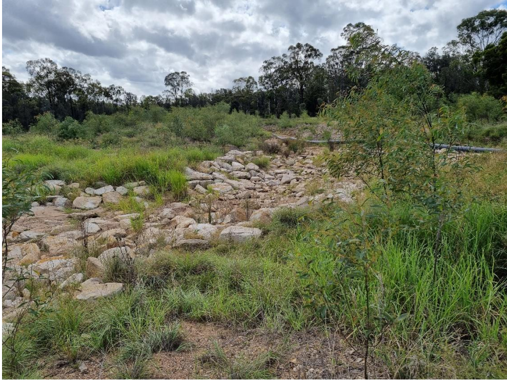
Photograph 5 - Stabilised Drain