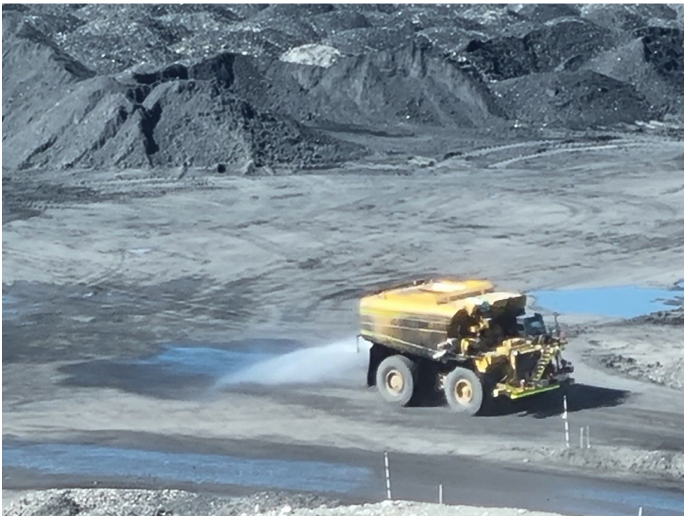
Photograph 2 - Water Cart