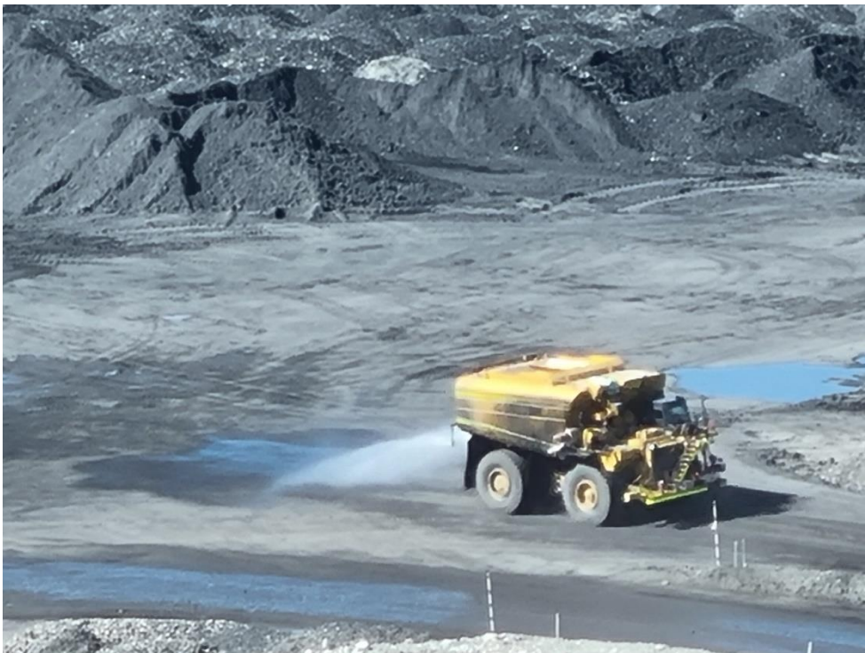
Photograph 2 - Water Cart