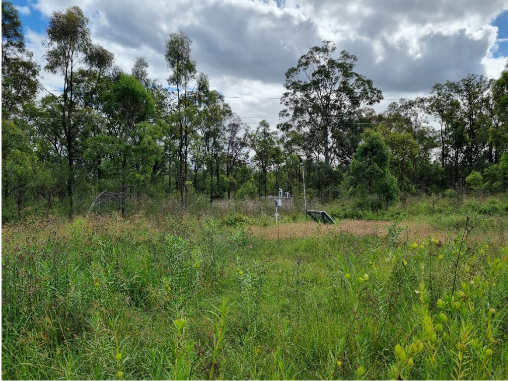
Photograph 3 - Weather Station