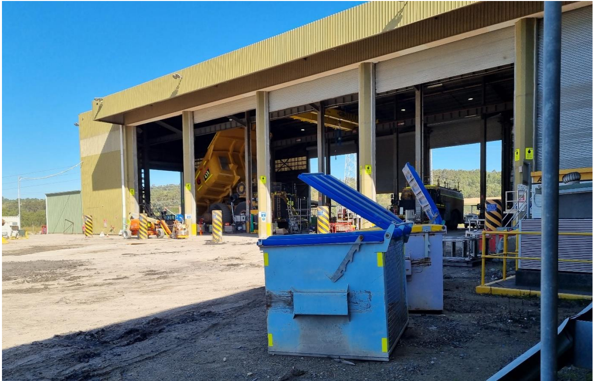
Photograph 11 - Mt Thorley Heavy Plant Maintenance