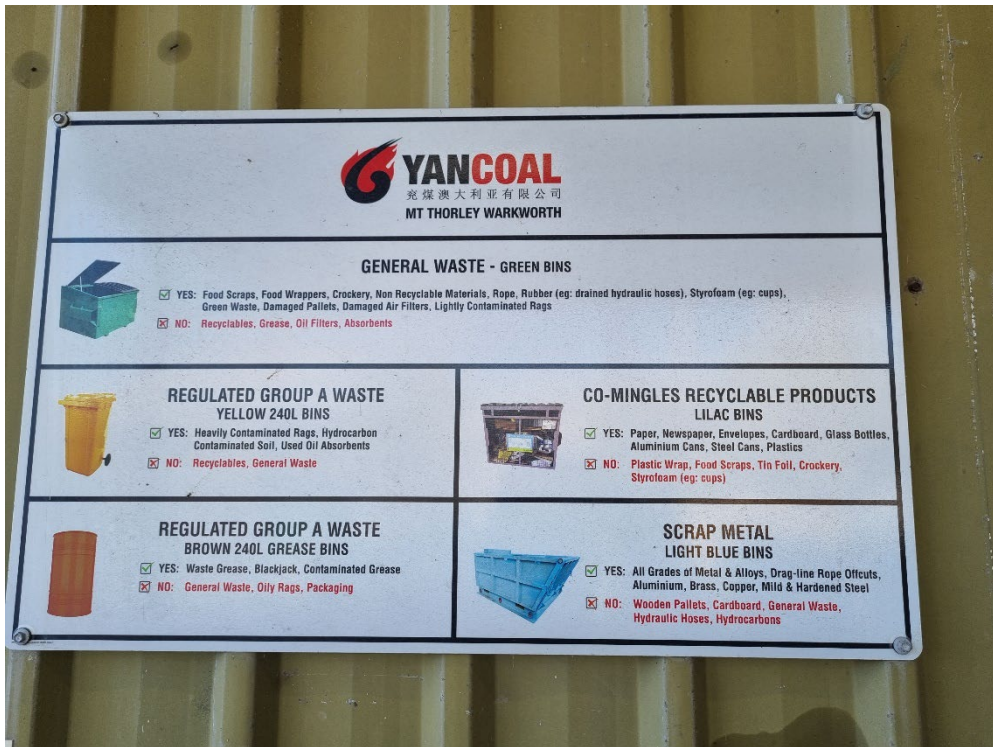
Photograph 6 - Waste Storage Signage