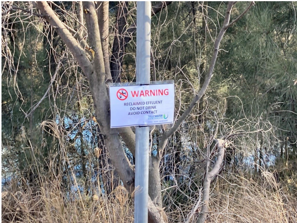
Photograph 12 - Dam 1S signage