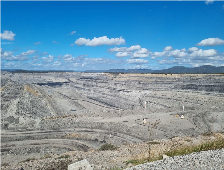
Photograph 1 - Warkworth Open Cut Mine