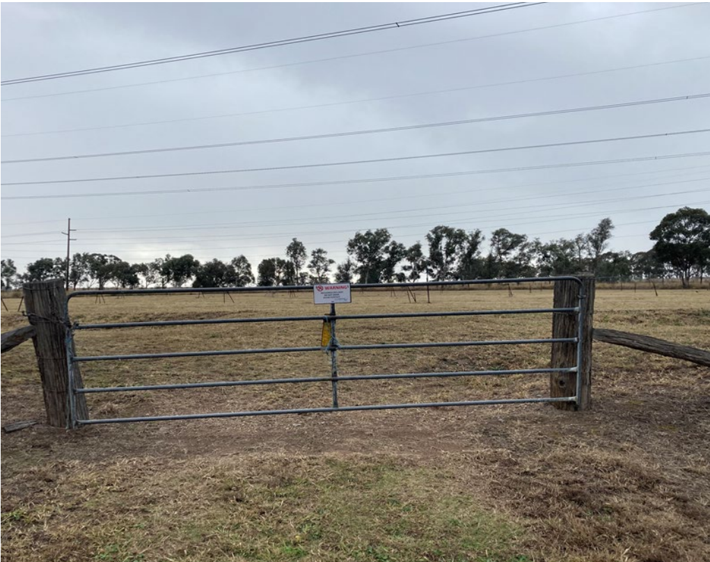
Photograph 8 - Effluent Irrigation Area