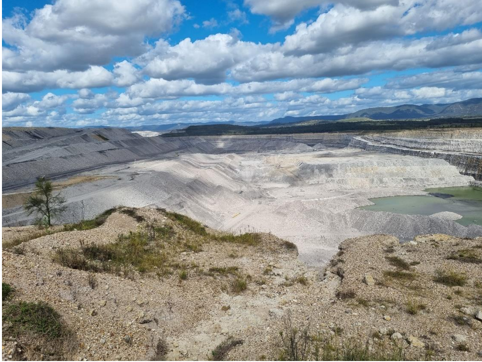
Photograph 7 - Mt Thorley Open Cut Pit