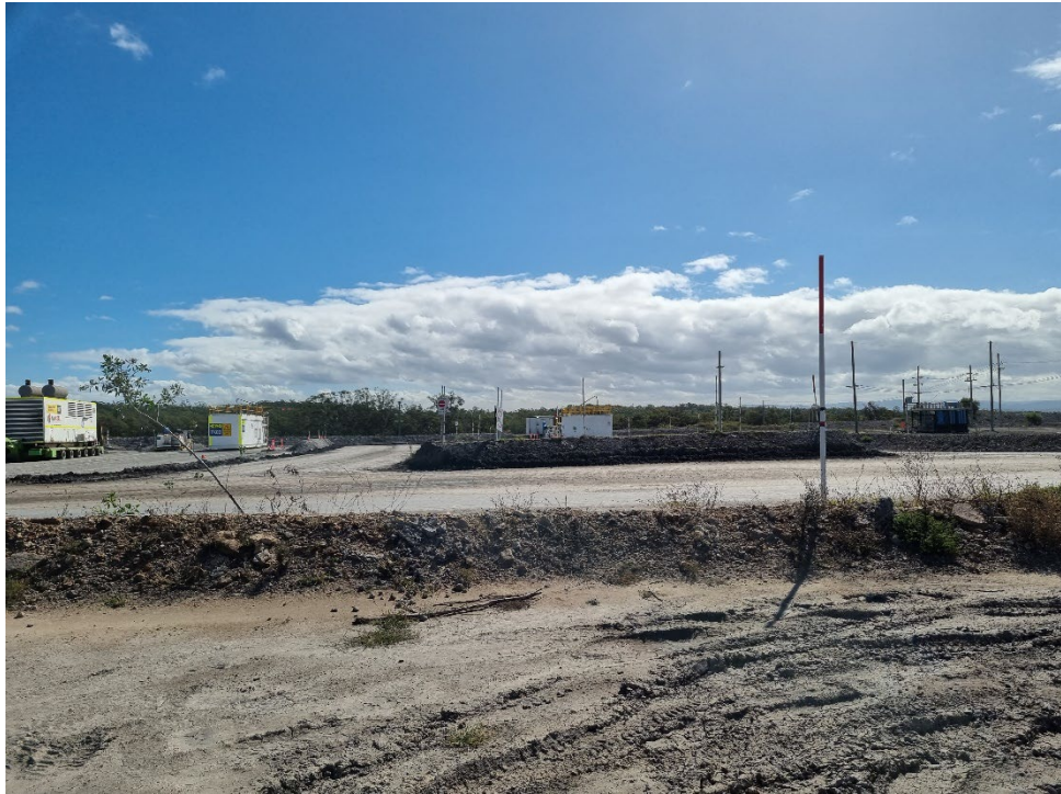
Photograph 9 - Self Bunded Fuel Tank and Generator (Warkworth)