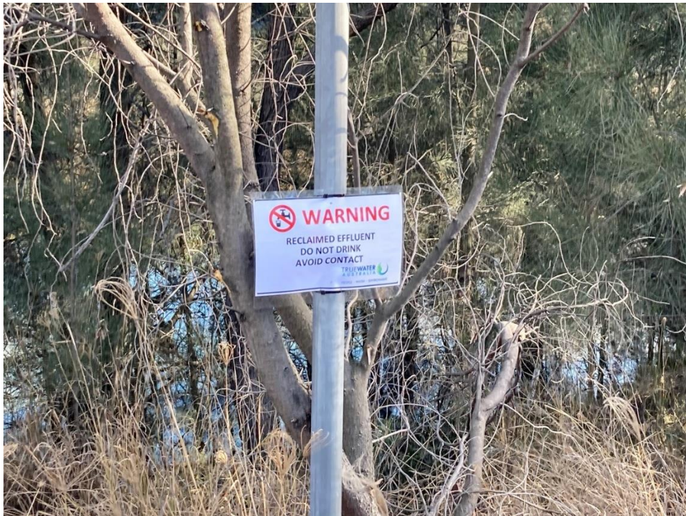
Photograph 12 - Dam 1S signage